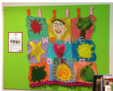
photo of your child next to it and email it into me to share on our Facebook page ( head@dorking.surrey.sch.uk ) or share it on social media with the hashtag #WeareDorking!

We have been working with Gilliangladrag Fluffatorium in West Street to create a felt wall hanging. It is currently on display in the Dorking Library - please check it out!! Take a